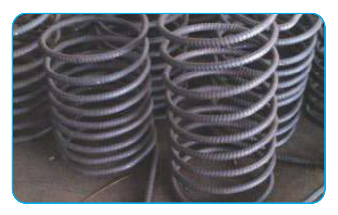
Helical or Spring